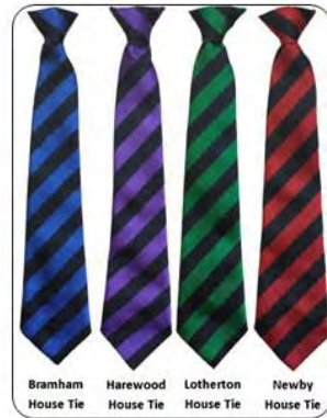
Bramham House Tie Harewood House Tie Lotherton House Tie Newby House Tie House Ties