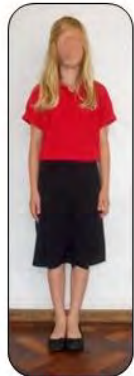
Girls Skirt Length